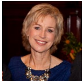
Sally Magnusson Scottish Patron

It has been another successful year for Music in Hospitals Scotland and it is with much gratitude that we highlight the commitment of the many talented musicians and generous supporters who make it all possible.